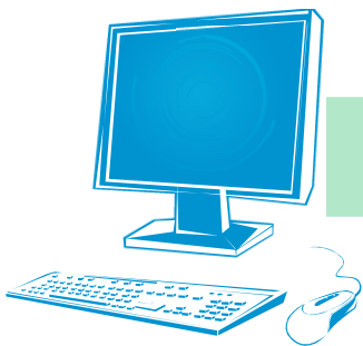
Your Physician Data Files